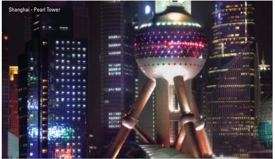
Shanghai - Pearl Tower