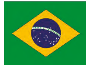
partner country 2011: Brazil

After the big success of a Malaysian delegation participating at the SafetyWeek 2010, we are planning a visit of a group of Brazilian safety experts for 2011. Brazil has a high demand for safety knowledge and technologies due to the new safety legislation and the introduction of Latin NCAP in 2010.